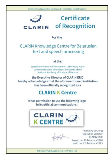
Figure 1. CLARIN Certificate of the Belarusian centre