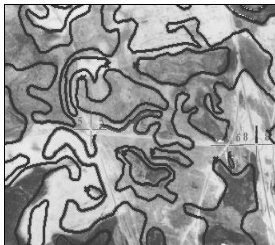
Fig.2. Joint mapping of the vectorial data and raster