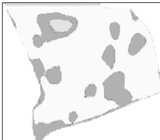
Fig.4. Result of cluster analysis of this fragment

3-rd cluster – dark grey image photo tone – sod-podzol slightly gley mellow-sandy soils. The contents of humus oscillates from 2,3 up to 3,4 %. The mean factor of spectral reflection of these soils at field moisture capacity makes 5,6 %.